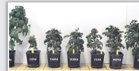
Fig 1: Viroid symptoms on tomato plants.

Check your production site frequently for the presence of new pests and unusual symptoms. Make sure you are familiar with common pests of your industry so you can recognise something different.