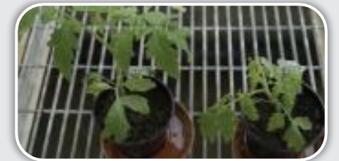
Figure 3. Infected plant on right showing slight leaf discoloration. Image from DPV411 Fig.13