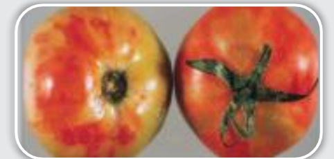
Figure 2. Tomato fruit symptoms showing uneven ripening and surface 'marbling' (left), healthy with normal appearance (right). Image from DPV411 Fig. 6