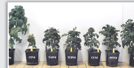
Fig 1: Viroid symptoms on tomato plants.

Check your production site frequently for the presence of new pests and unusual symptoms. Make sure you are familiar with common pests of your industry so you can recognise something different.