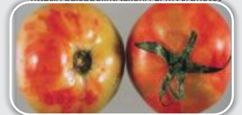
Figure 2. Tomato fruit symptoms showing uneven ripening and surface 'marbling' (left), healthy with normal appearance (right).

spot symptom