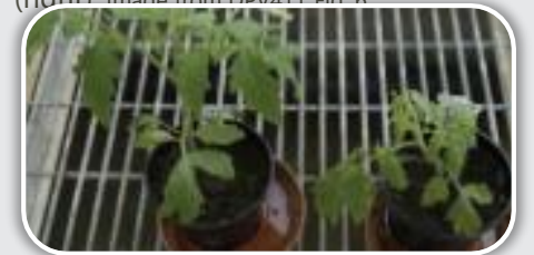
Figure 3. Infected plant on right showing slight leaf discoloration. Image from DPV411 Fig.13